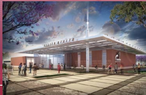
Proposed Allied Health Building