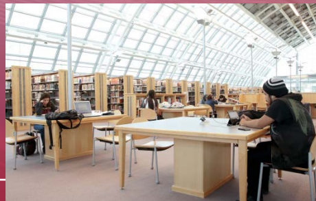
Library – Student Success Center