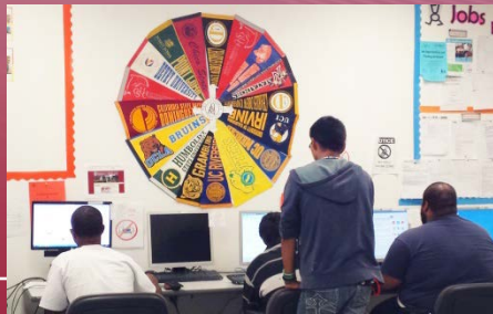
Transfer & Career Center