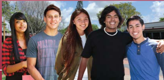
New Student Welcome Day