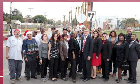
Main Road Grand Opening