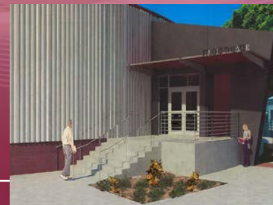
Proposed Bond Project