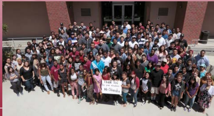
2013-14 First Year Experience