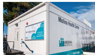
Molina Health Center