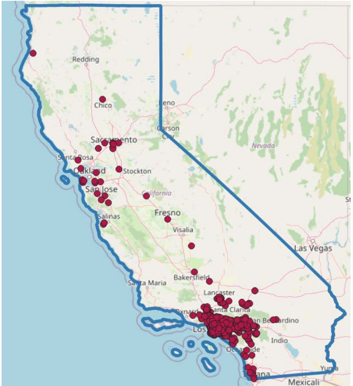
Figure 1. Visualization of each enrolled Compton College student within California in 2020-2021.