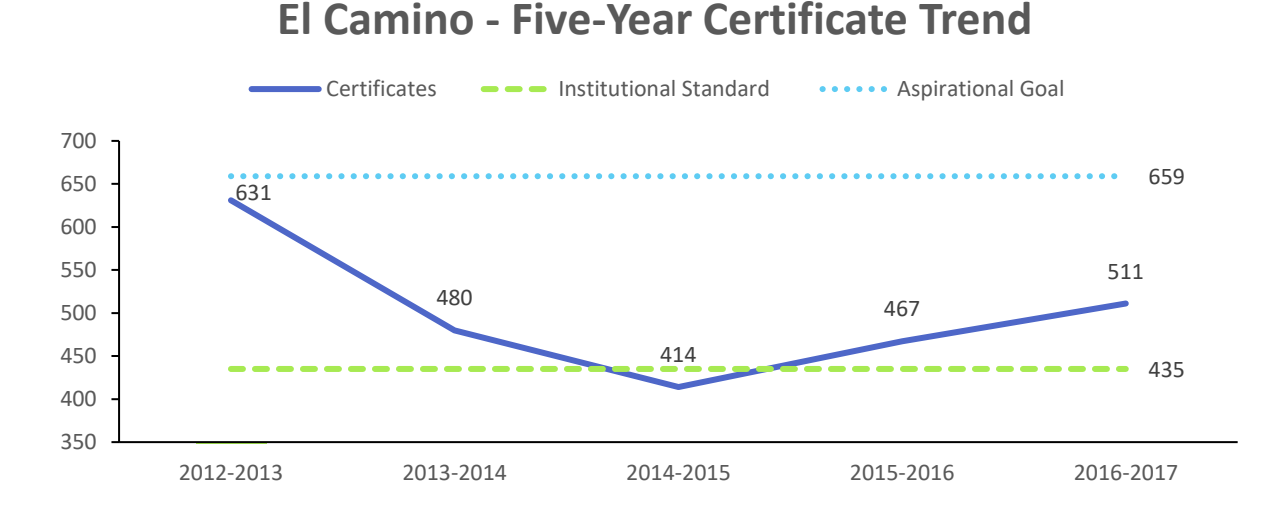
Figure 2. Five-Year Certificate Trend

Table 2 also shows that El Camino College experienced two consecutive decreases in the total number of associate degrees awarded. Decreases in associate degrees occurred in 2013-14 and 2014-15. Decreases in AA awards in 2013-14 contributed to the overall decline in associate degrees for that academic year. Decreases in AS awards in the 2014-15 contributed to the second year of overall associate degree awards in that academic year. El Camino College quickly rebounded from two consecutive years of decreases to have the largest number of associate degrees awarded in 2016-17.