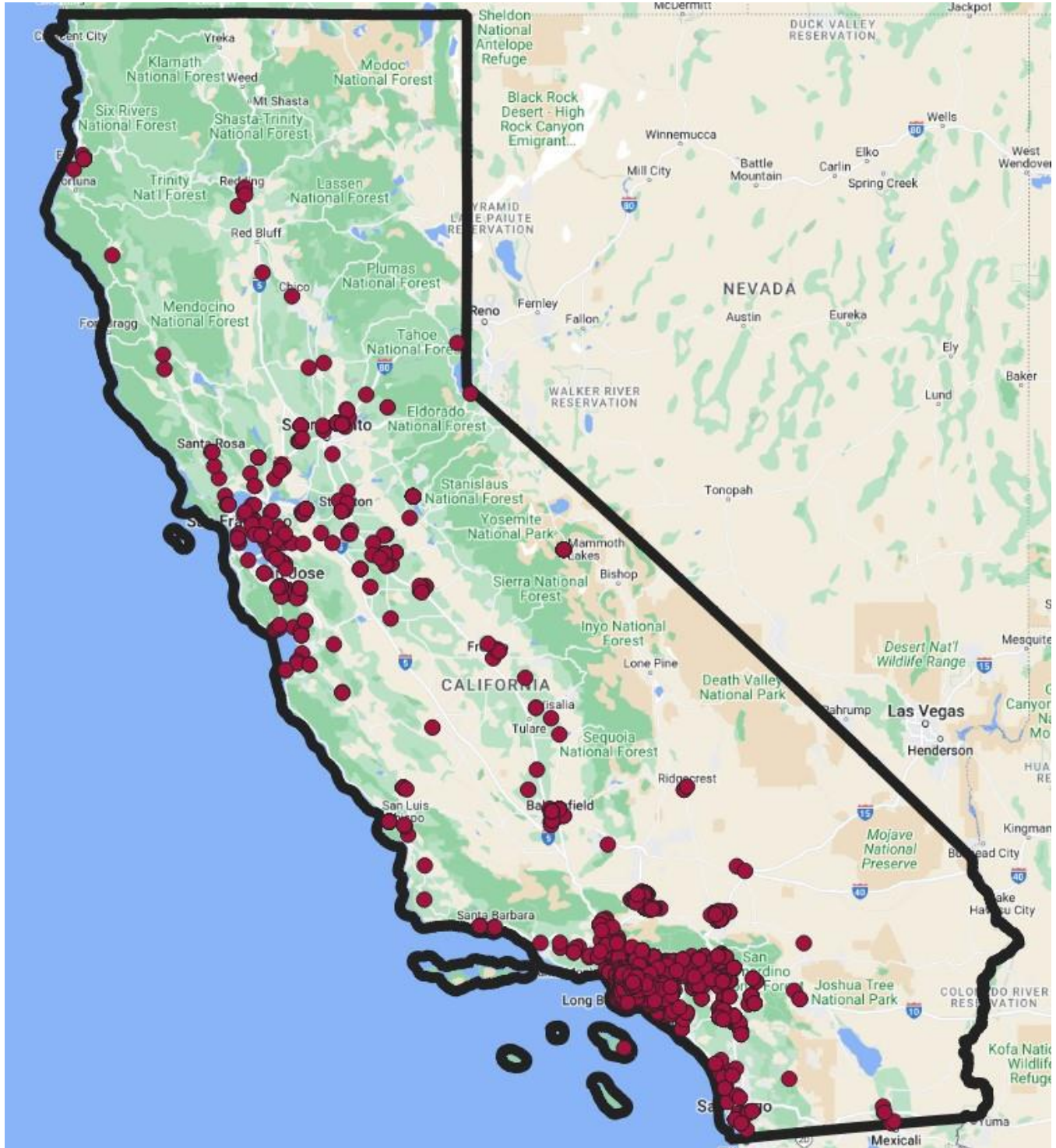
Figure 1. Visualization of each enrolled Compton College student within California in 2023-2024.