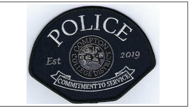
Prepared by Compton College Police Department

<u>GENERAL BUSINESS LINE</u> Compton College Police Department (310) 900-1600